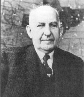
Anton T. Boisen